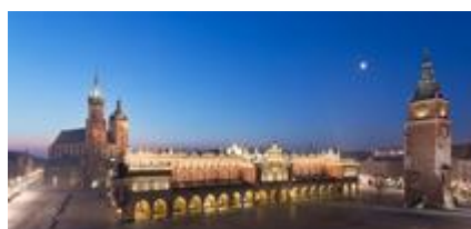
Photo 3.1. Main square in Krakow

For photographs the word "Photo" is used, followed by the number (in the same way as in the case of the description of the figures and tables). The rules for recalling and describing a photograph are the same as in the case of describing the figures.